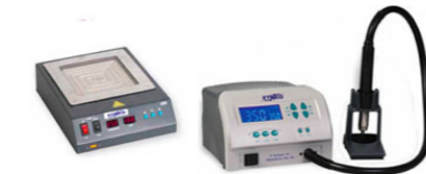
Fixture Base for Hot Air unit model E800L for Easy Rework