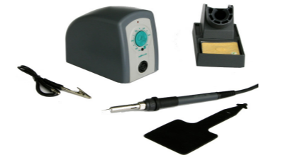
Auto Feed Soldering Unit model 376D