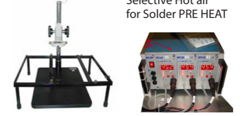
Selective Hot air for Solder PRE HEAT