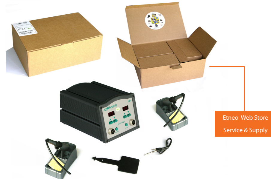
Etneo Web Store Service & Supply