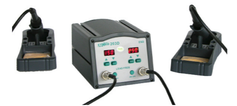
High Power Soldering stations Power supply solid state 320W