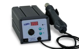
Multifunction Stations - Soldering - Desoldering- Hot Air